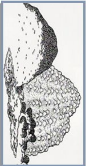
Encrusting, Mound, & Boulder Corals