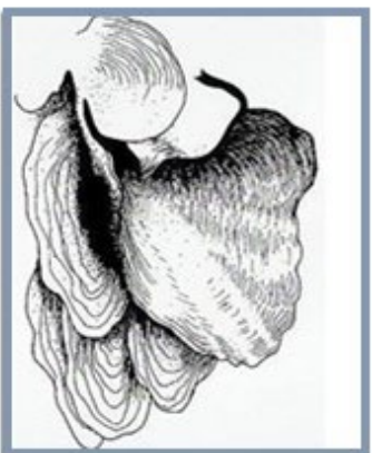
Plate, Leaf, & Sheet Corals