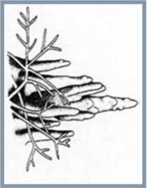
Branching & Pillar Corals